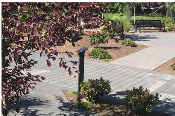
Touchstone Paver walkway in Ebetsu Plaza.

The Gresham Japanese Garden is NOT one of those organizations. First, we are solely run by volunteers, and our bylaws do not support paid staff. Secondly, we learned from the past mistakes of Tsuru Island such as, not having maintenance plan. And third, Jim Card's background as a landscape contractor was all about maintaining spaces.