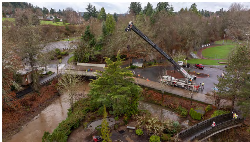
Top: Troy Guisto with Burns Feed Store with his fully loaded trailer of boulders. Bottom: Barnhart Crane moving boulders onto the island.