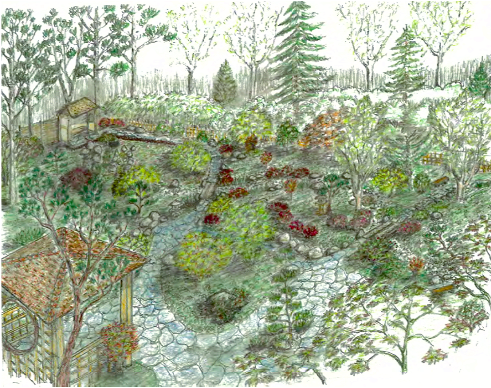
Looking southeast at Tsuru Island's future landscape. In this view, when you sit in the azumaya looking out you can will see an island of maples and beautiful boulder work.