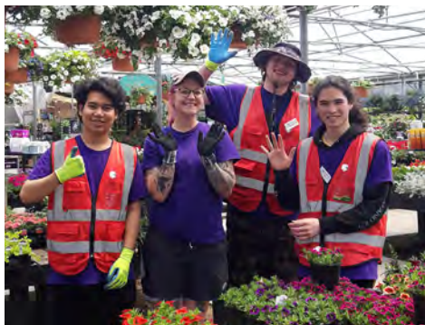
Photo of our 2025 interns and staff working at Al's.

started the worksite program teaching horticulture skills to students from the Gresham-Barlow School District who were enrolled in their Adult Learning Program.