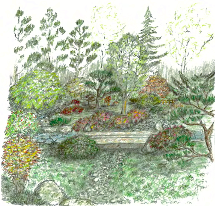
East view looking past the first new basalt stone bridge. It must be May, the azaleas are in bloom.

His other community involvements include serving on the Gresham Urban Forestry Subcommittee, Deer Glen HOA Design Review Committee, and singing in the Gresham Community Choir.